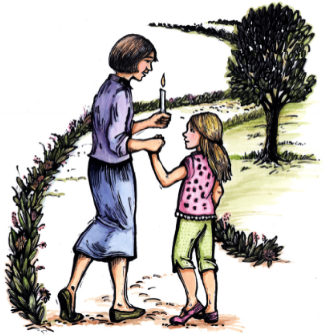
Parents and grandparents can show children how to bring prayer into their day.

Help children understand that prayers to God are no more limited to certain times or words than any relationship is. Saying, "God, help me with my test" or "Help Grandpa get better" are prayers. When afraid, we can pray to God for help. When we see someone in need, we can pray that God will be there for them through other people. Model this for your chil-