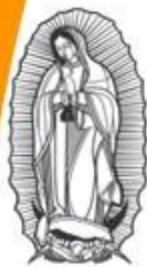
Our Lady of Guadalupe, pray for us.

On December 12, there will be a special collection for the TRC Healing Response in all parishes of the archdiocese. You can also support the TRC Healing Response any time via this link https://archregina.sk.ca/giving or by calling the archdiocesan office at 306-352-1651.